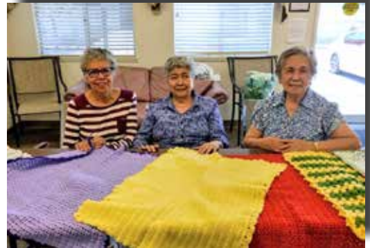
Olson Rotary Village