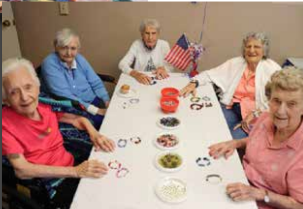
(Right) The group of volunteers from Sun City Gardens.

Some of the Assisted Living residents of Sun City Gardens in Menifee, California have been working together to create bracelets to donate to a nonprofit local group that assists in placing foster children into loving homes. The bracelets each have an inspirational saying. The children often arrive in these homes with nothing but the clothes on their backs and they really appreciate the lovingly hand crafted pieces of jewelry.