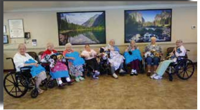
(R) Auburn Ravine Terrace