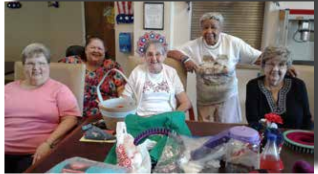
(R) Independence Square