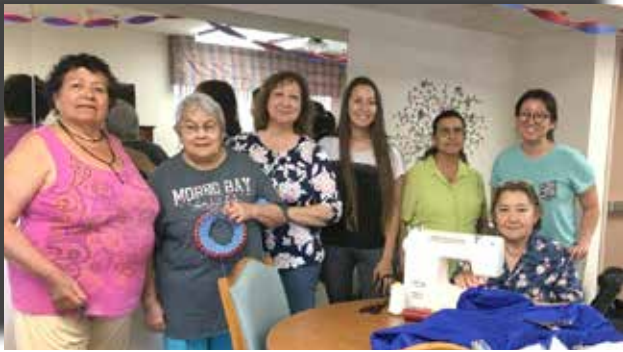
(L) La Mirada Vistas