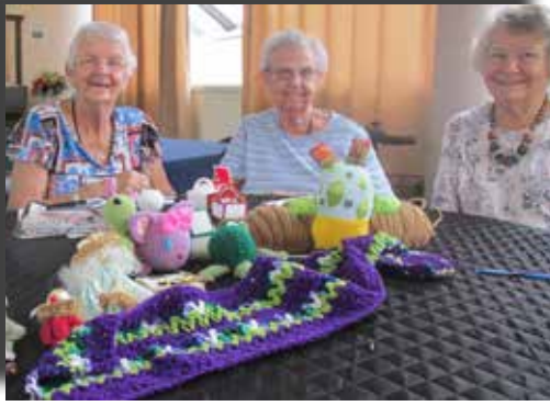
Courtenay Springs Village