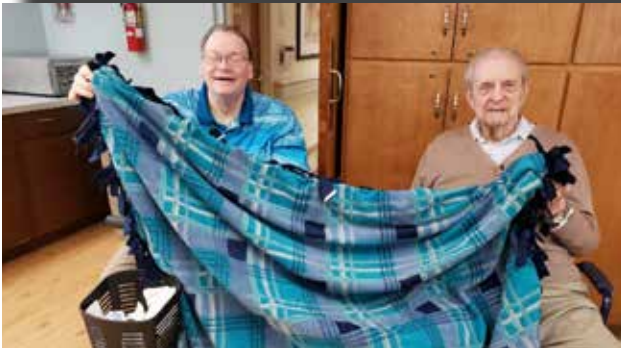
(L) Pioneer House