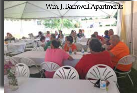
Wm. J. Barnwell Apartments

RHF just recently acquired Wm J. Barnwell Apartments, an affordable senior community in Perryville, MO, from the Perryville Knights of Columbus so their event also served to welcome residents and staff to the RHF family of communities.