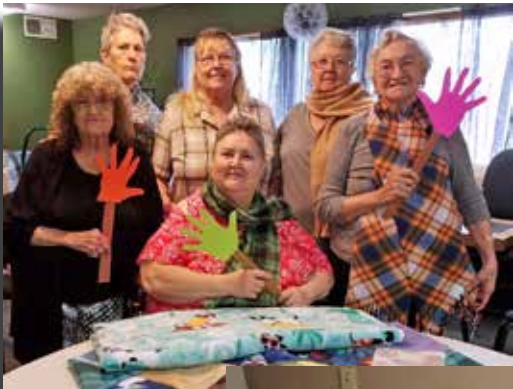
(Above) Camelot Village residents.

A new Project H.A.N.D.S.® group has formed at Camelot Village in Council Bluffs, Iowa. This group has been working hard to put together picture books and laminated place mats for the patients at the local children's hospital. They have collected everything from old calendars to greeting cards to magazines and are cutting out the pictures to use as decoration for their projects. This group also makes fleece hats, scarves and lap blankets for patients going through chemotherapy at Heartland Oncology in Council Bluffs, Iowa. They have even made patchwork square blankets from fleece which are very colorful and cheerful. We are told that these residents have enjoyed the opportunity to reach out to their community. They are proud of their handiwork.